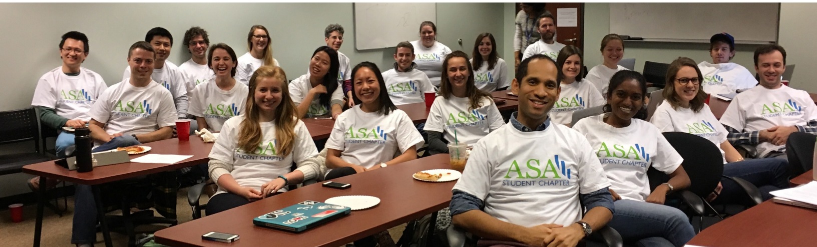
Members of the Vanderbilt ASA Student Chapter.

THE ASA HAS RESOURCES TAILORED JUST TO YOU