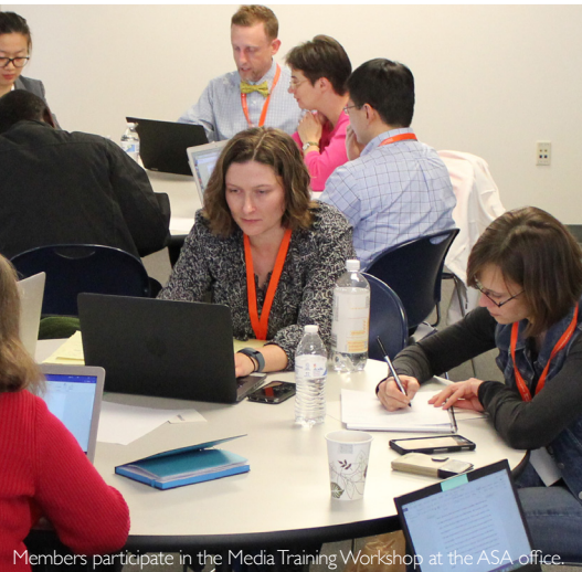
Members participate in the Media Training Workshop at the ASA office.