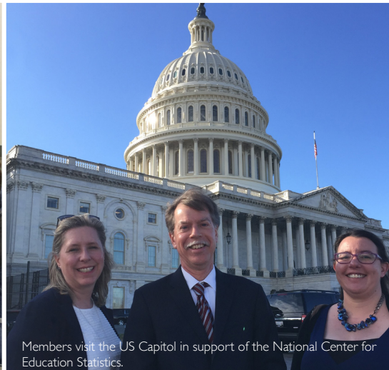
Members visit the US Capitol in support of the National Center for Education Statistics.